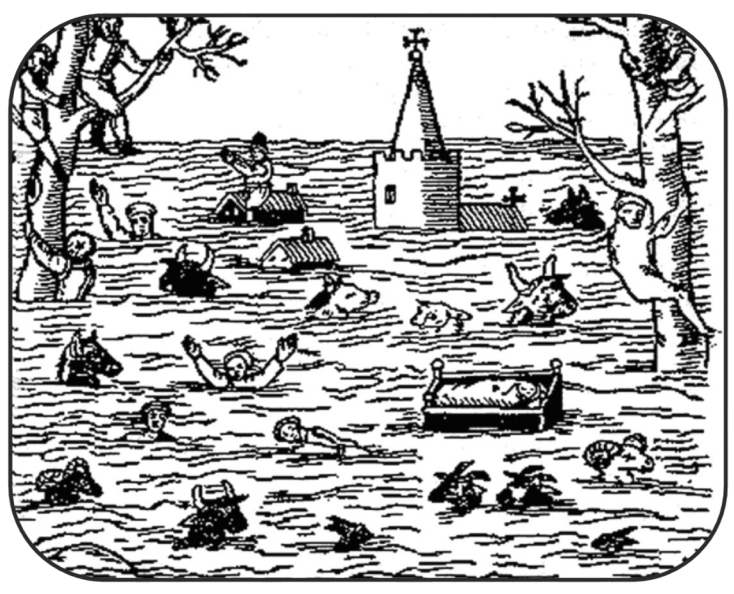
A Tsunami Struck in 1607.

of his name - which was actually created in 1944!