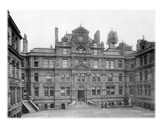
The First £1million Deal was closed in Cardiff Coal Exchange in 1907